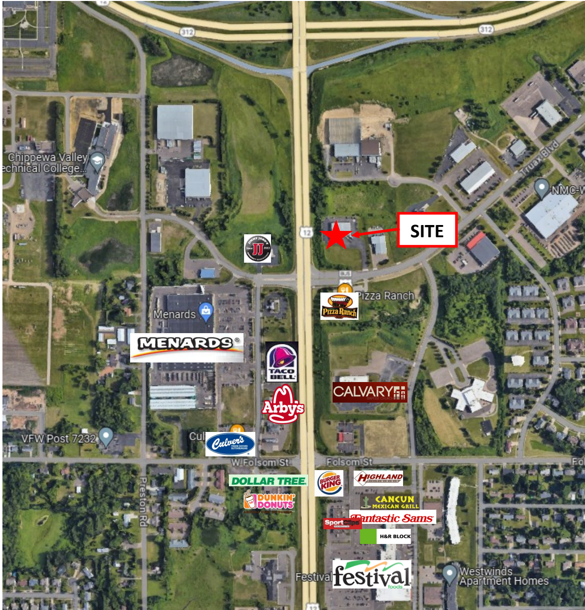
Google Maps, 2024